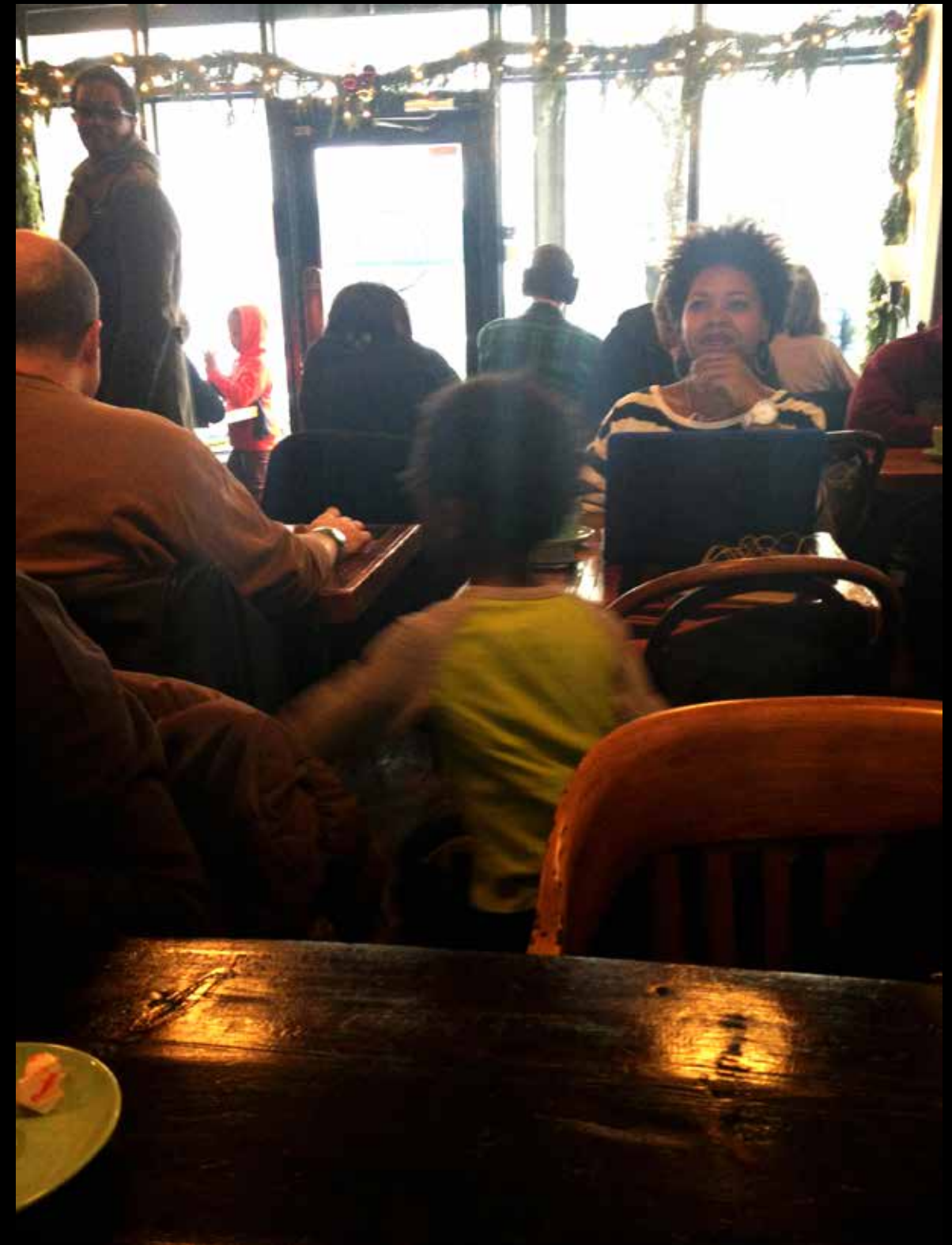
Serenity. Harlem 2013