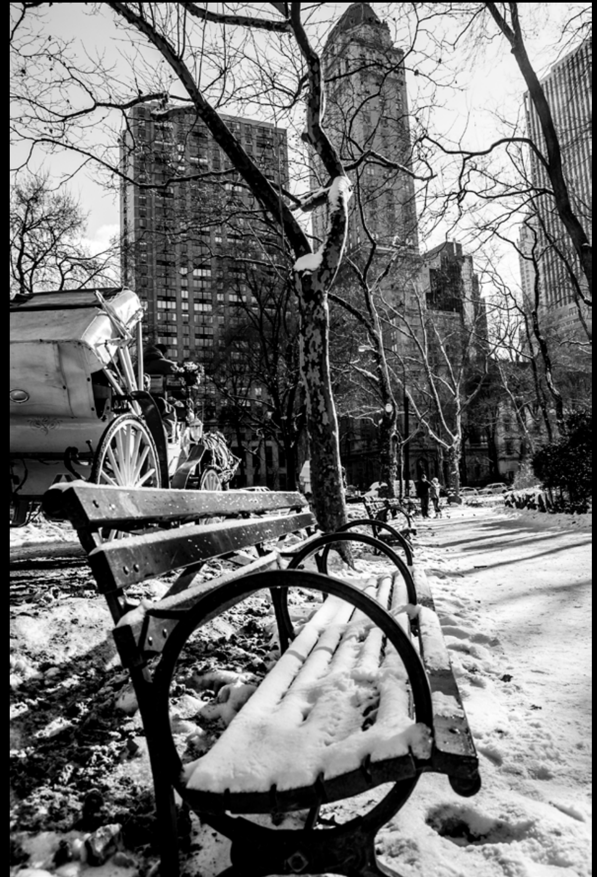
Promenade. Central Parck 2013