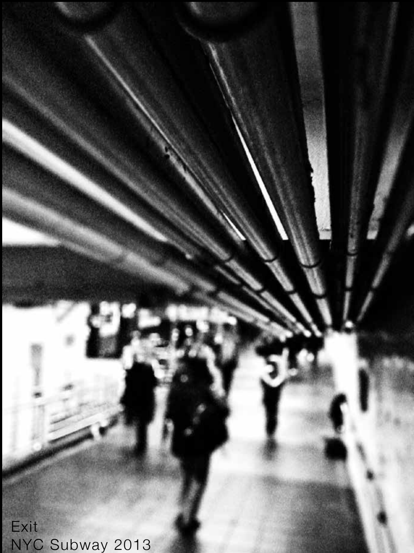
Exit NYC Subway 2013