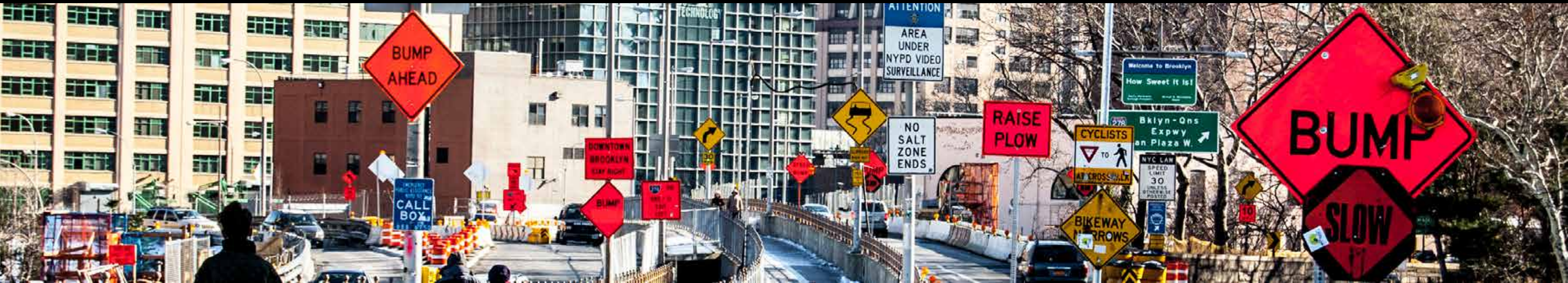
Understand Brooklyn Bridge 2013