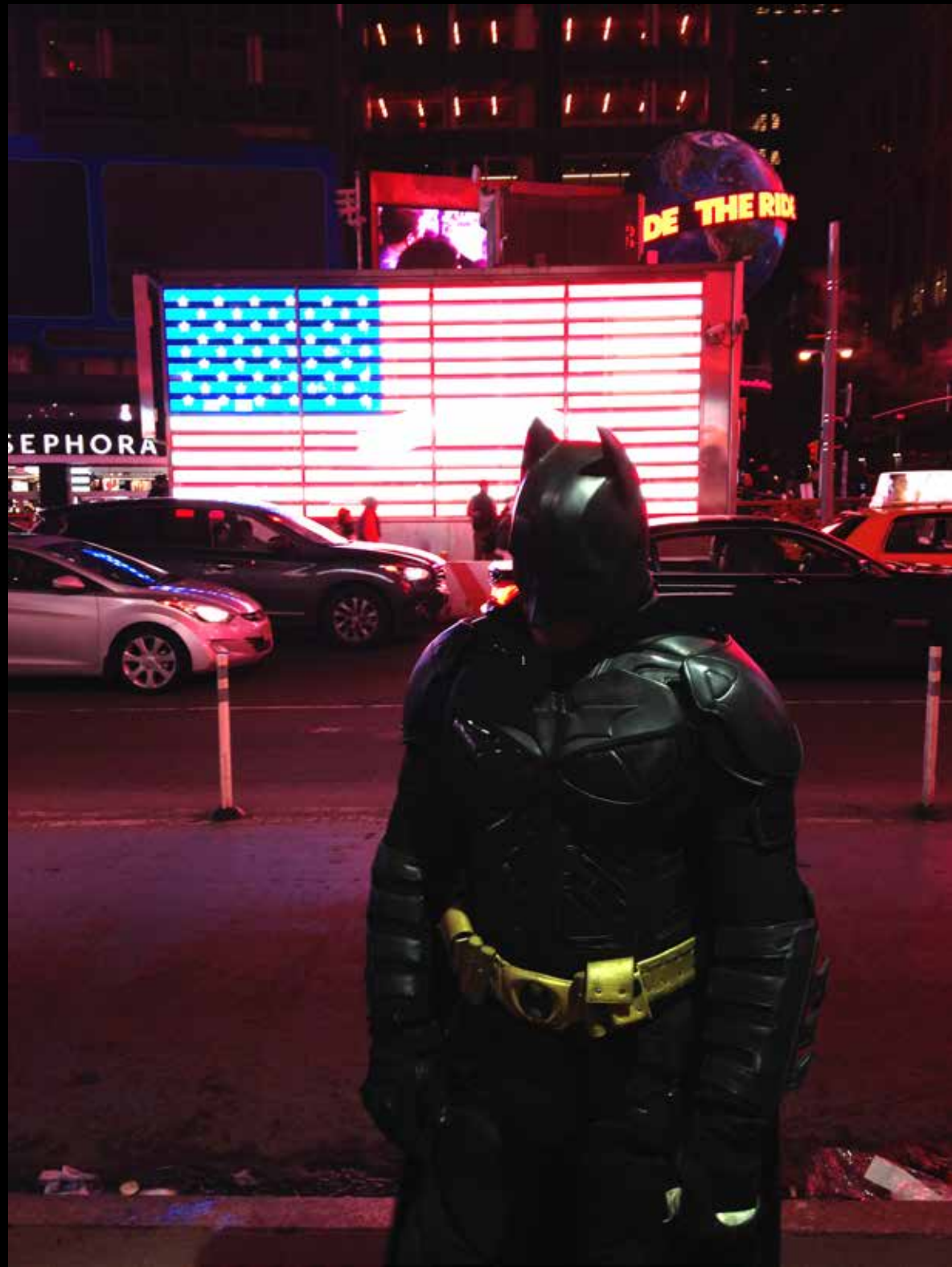
Batman is coming to town. Time Square 2013