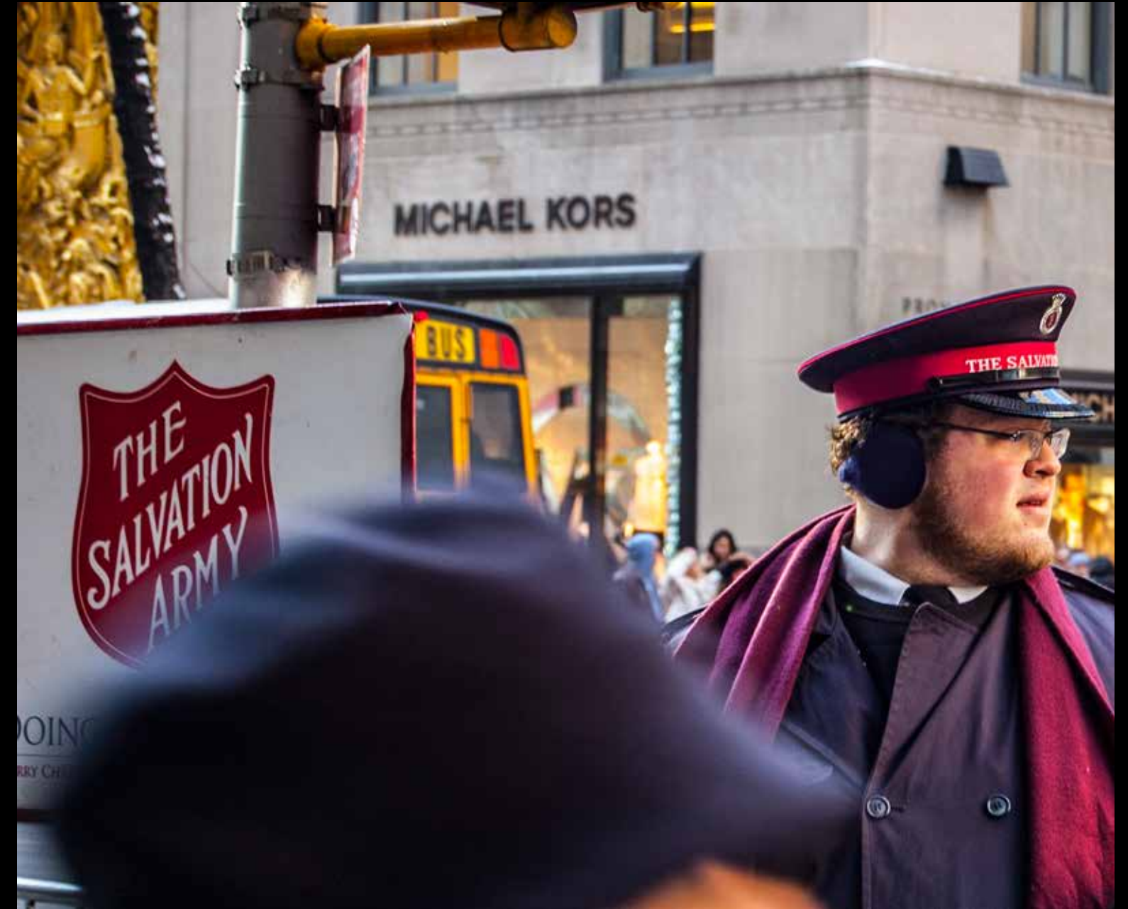
Salvation 5 avenue 2013