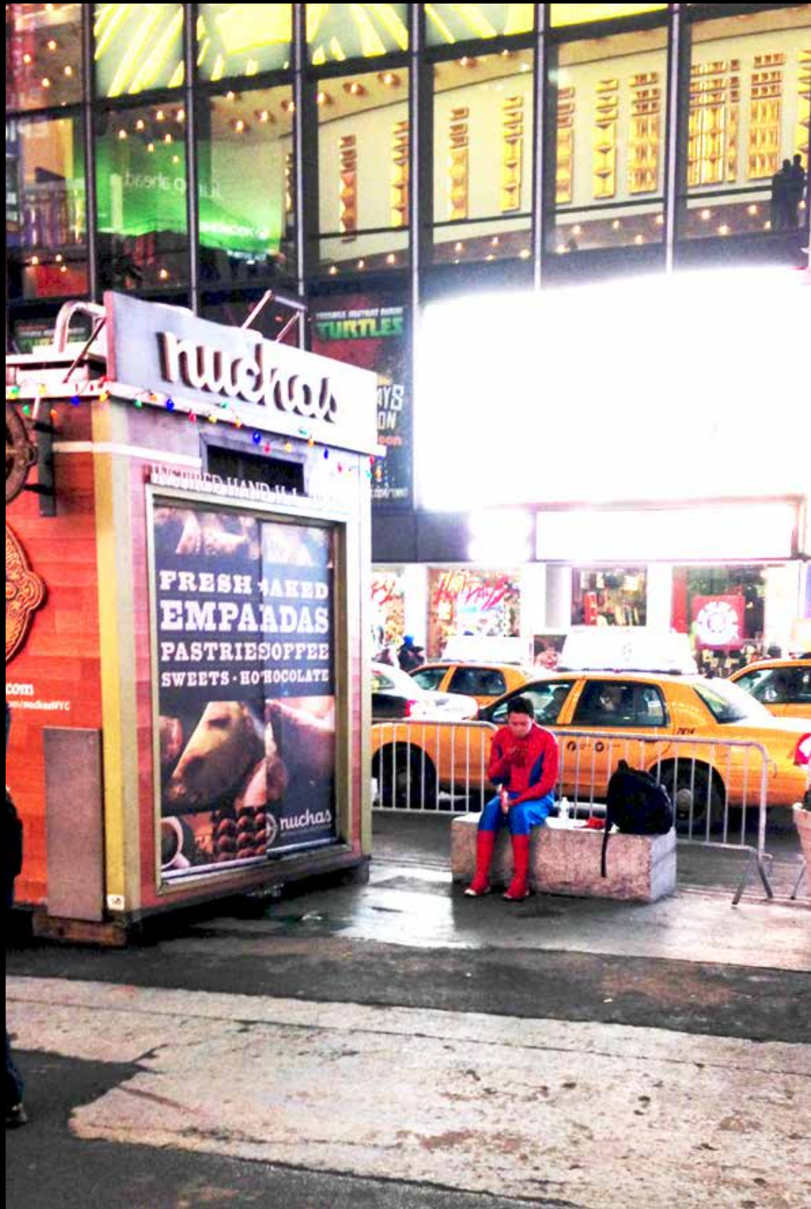
Spider-Man reveals identity. Time Square 2013